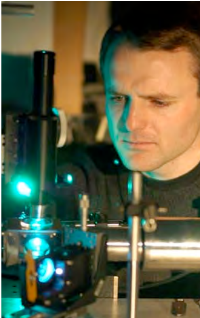
The use of optics technology and lasers (above) have widespread application for propulsion and sensor development at The University of Alabama in Huntsville.

and simulation, software engineering and artificial intelligence, and nanotechnology are among emerging research areas for UAH, as well as devising state-of-the-art programs in rotorcraft and systems engineering, logistics, supply chain management and lean manufacturing.