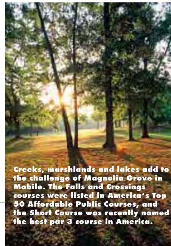
Creeks, marshlands and lakes add to the challenge of Magnolia Grove in Mobile. The Falls and Crossings courses were listed in America's Top 50 Affordable Public Courses, and the Short Course was recently named the best par 3 course in America.

"I was in Spain recently and saw a guy wearing a Robert Trent Jones Golf Trail t-shirt," he says. "This trail has made people everywhere knowledgeable about Alabama."