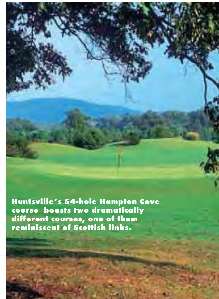
Huntsville's 54-hole Hampton Cove course boasts two dramatically different courses, one of them reminiscent of Scottish links.

The Legends at Capitol Hill, a 90-room hotel, has a one-to-one staff/guest service ratio plus award-winning chefs who offer a delicious sampling of Southern cuisine.