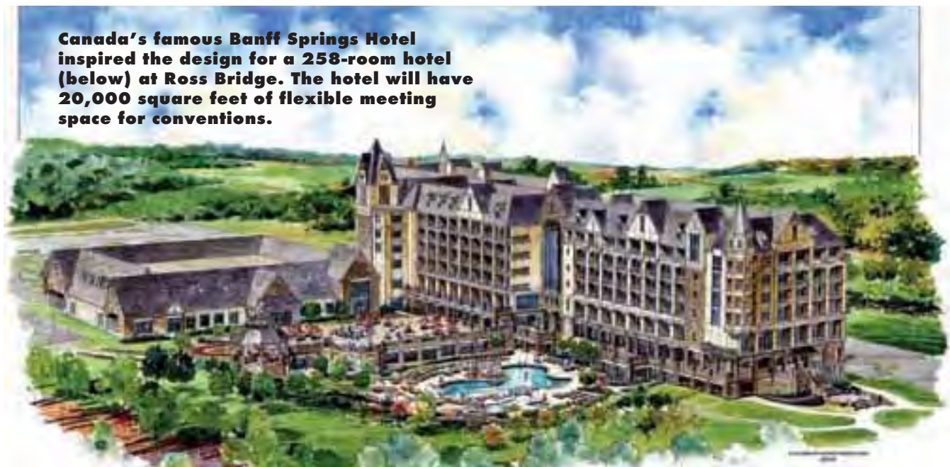
Canada's famous Banff Springs Hotel inspired the design for a 258-room hotel (below) at Ross Bridge. The hotel will have 20,000 square feet of flexible meeting space for conventions.