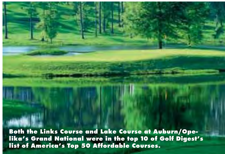
Both the Links Course and Lake Course at Auburn/Ope- lika's Grand National were in the top 10 of Golf Digest's list of America's Top 50 Affordable Courses.

Both the Links Course and Lake Course at Grand National were in the top 10 of Golf Digest's list of America's Top 50 Affordable Courses, and with good reason. The par-four 18th hole on the Links is