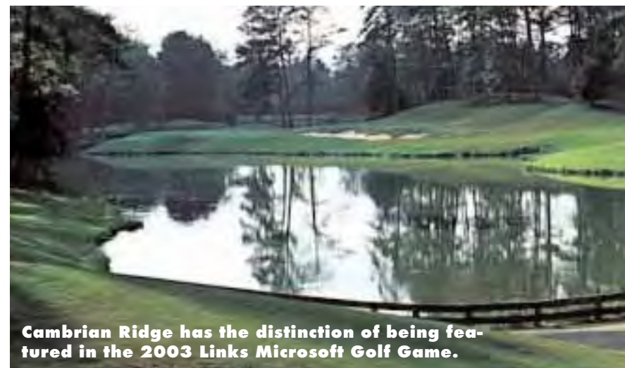
Cambrian Ridge has the distinction of being featured in the 2003 Links Microsoft Golf Game.

the trail's strongest finishing hole, while the island green on the Lake's 15th hole is considered by many to be the single prettiest hole on the trail. More than half the holes of the Short Course touch scenic Lake Saugahatchee.