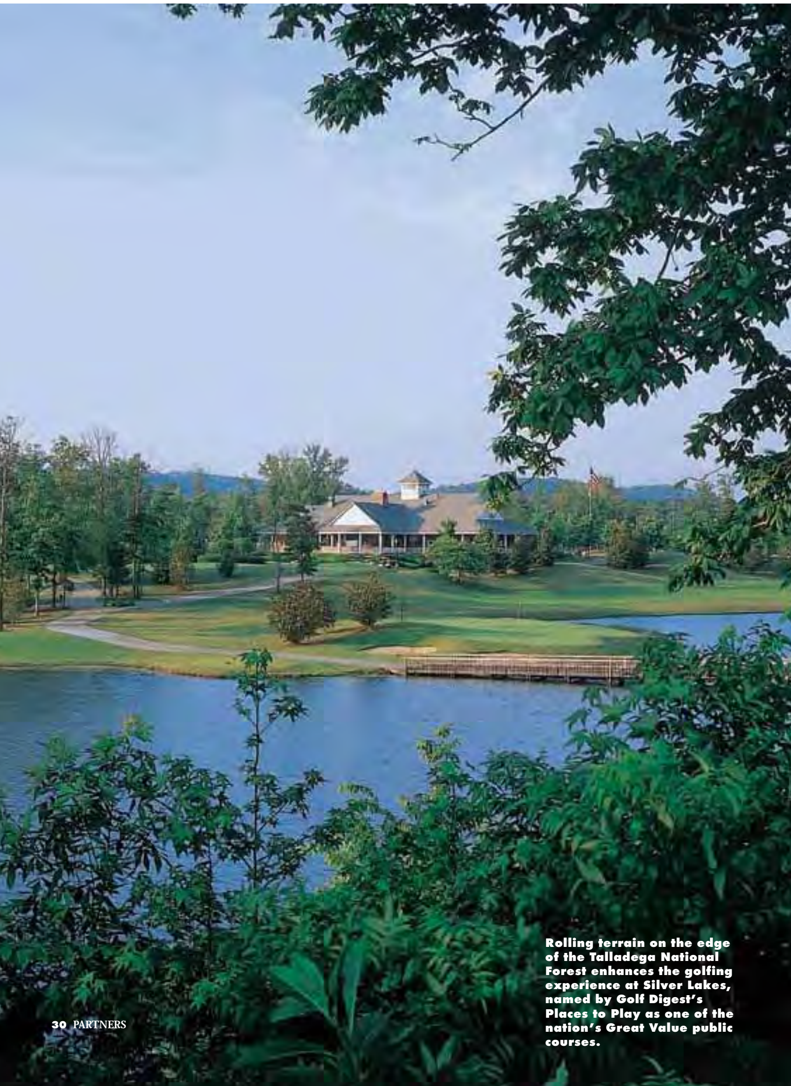
Rolling terrain on the edge of the Talladega National Forest enhances the golfing experience at Silver Lakes, named by Golf Digest's Places to Play as one of the nation's Great Value public courses.