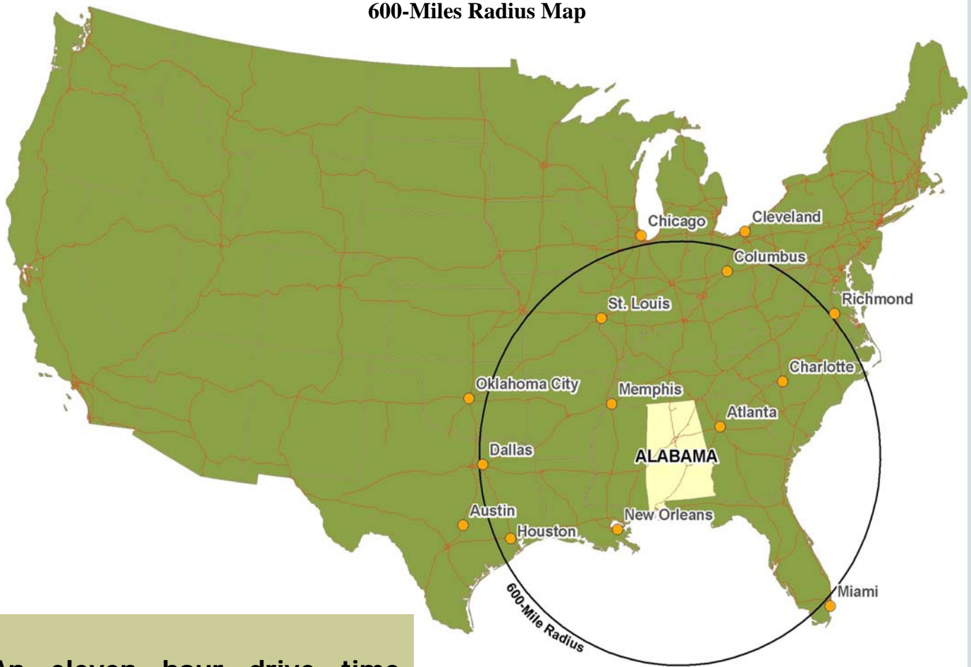
600-Miles Radius Map

An eleven hour drive time from the center of Alabama reaches west to Dallas/Fort Worth, north to Chicago, east to Charleston and south to Fort Lauderdale.